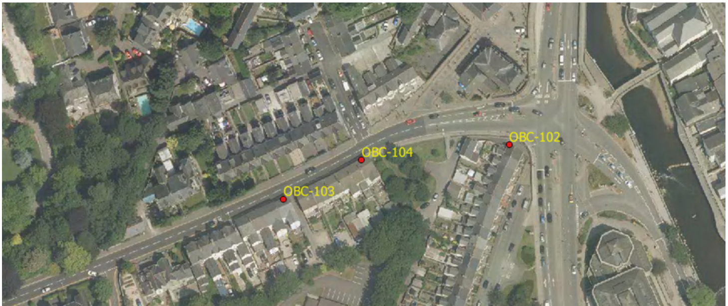
Figure 1 – 2017 NO 2 Diffusion Tube Monitoring Locations on Park, Street, Bridgend

4.3 For 2018, monitoring for NO 2 has been increased further along Park Street, with an additional two NO 2 monitoring sites implemented. These will continue to be monitored. Figure 2 illustrates the current 2018 network of monitoring for Park Street including the additional two locations (OBC- 109 and OBC- 110).